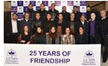
The MBA Class of 1994 reaffirms its support to LUMS

batch mates to give back to their alma mater. Through donations from 29 individuals, they were quickly able to increase the fund. The MBA Class of 1994 has certainly established a legacy that will help forward the University's mission to provide inclusive and accessible education for all.