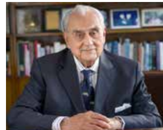
Syed Babar Ali, Founding Pro Chancellor, LUMS

The CLCS at the Department of Humanities and Social Sciences offers courses in literary studies in Persian, Urdu and Punjabi. The endowment will help strengthen the Programme and will also help fund the Mubarik Begum Annual Workshop for Urdu and Persian for Young Scholars .